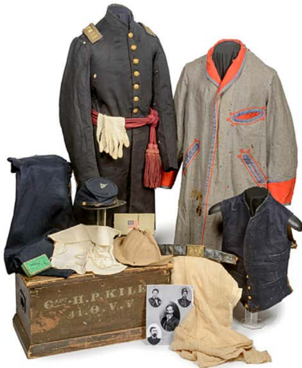
Capt. H.P. Kile, 41st Ohio Infantry Civil War Uniform with Camp Trunk, Captured Confederate House Coat and More Sold For $20,700

We are honored to continue our support of the Ohio Local History Alliance