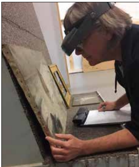
2017 Subsidized Survey at Mahoning Valley Historical Society

As part of our ongoing public service, each year ICA selects one collecting institution to receive a free, 2-day collection survey.