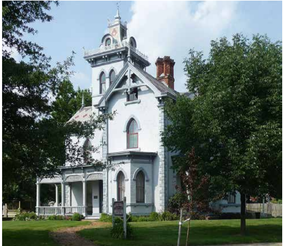
The Morris Sharp House / Fayette County Museum.